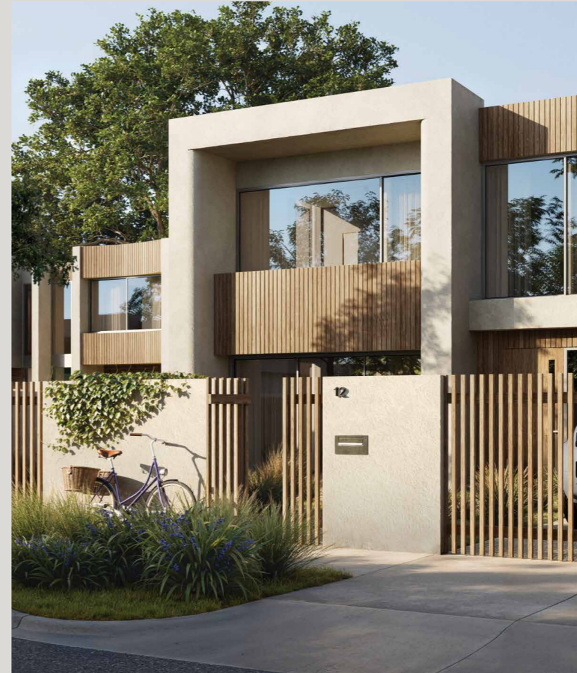
Milli, Brighton East