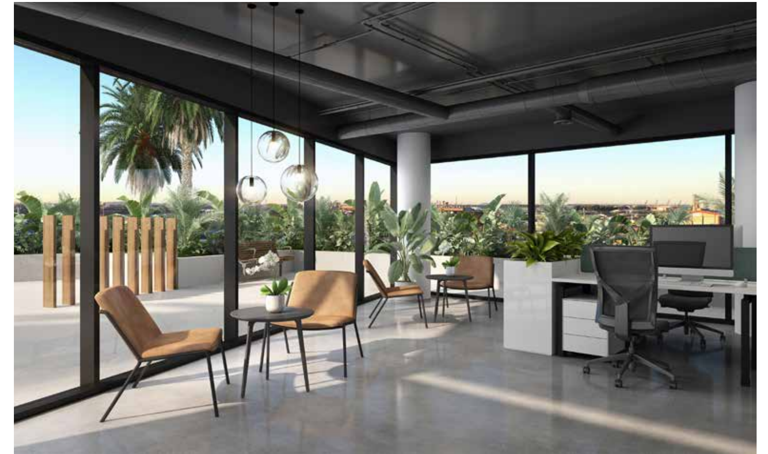
^ Collaborative work hub < Commercial precinct

At Dairy Farmers Towers, you can enjoy a lifestyle that will be the best place to live, work and play in Newcastle.