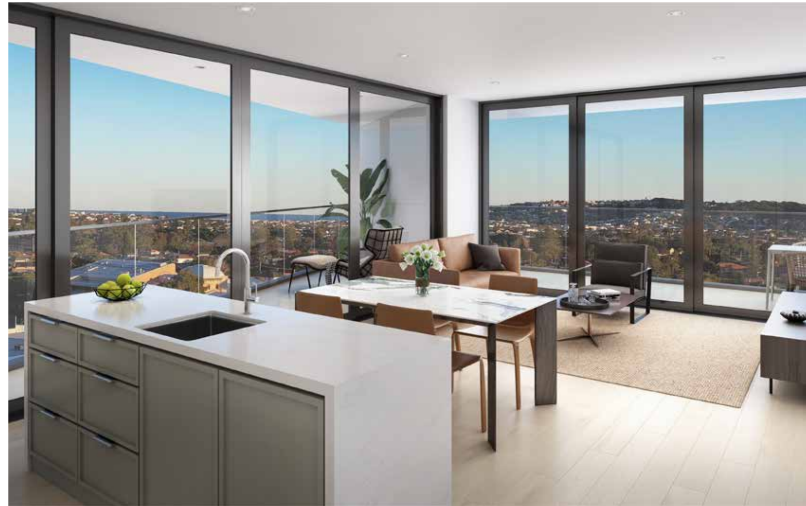
< Two bedroom apartment, living (South Tower) > Two bedroom apartment, bathroom (South Tower)