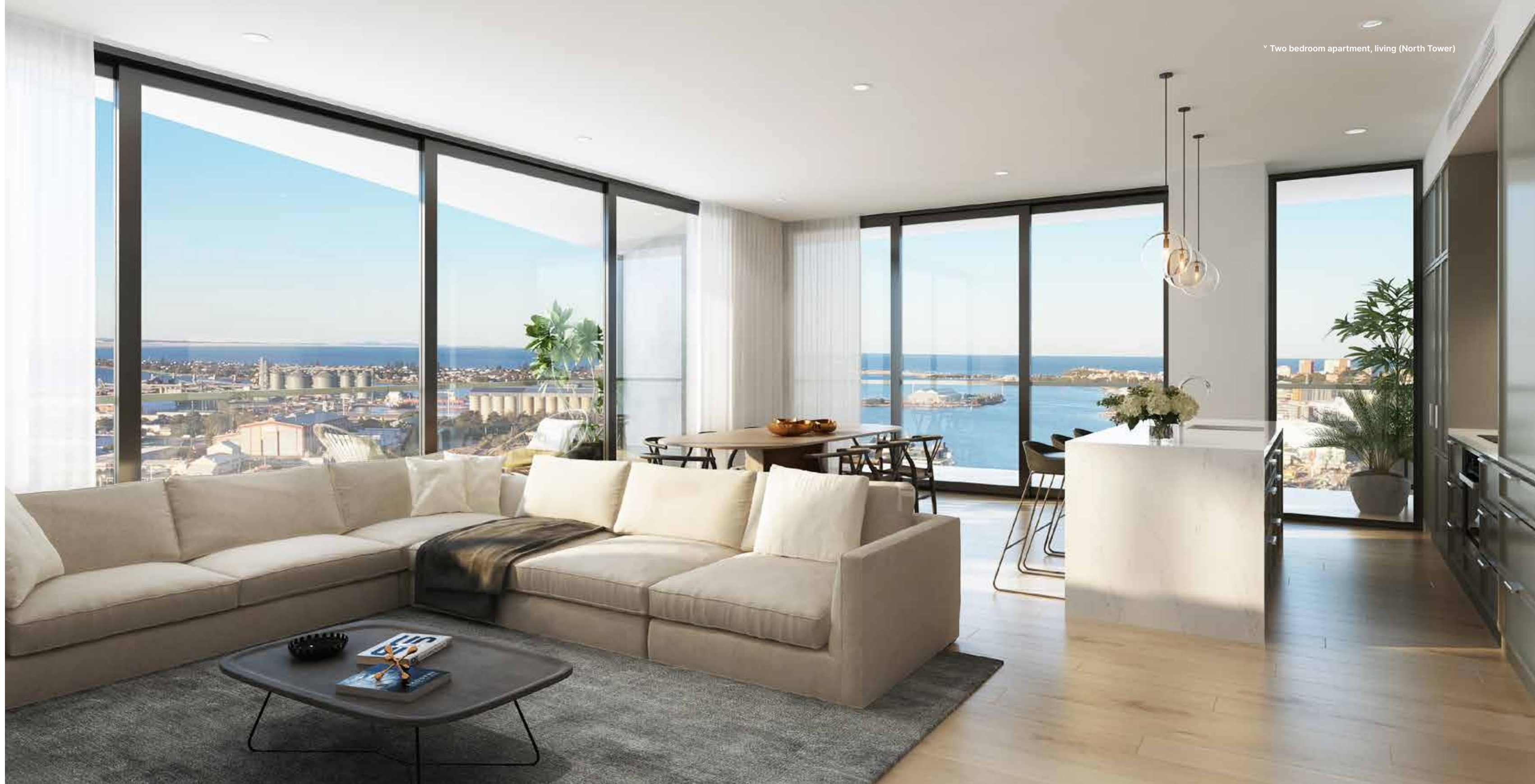
Two bedroom apartment, living (North Tower)