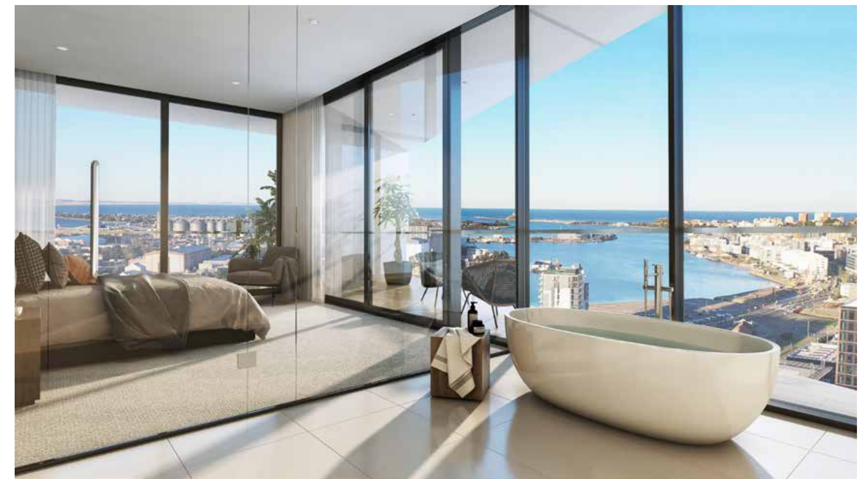
< Two bedroom apartment, living (North Tower) > Three bedroom apartment, bathroom (North Tower)

From floor to ceiling, inside and out, every space from your living areas through to your bathrooms and bedrooms has been meticulously considered with designer features and stylish inclusions at every touch.