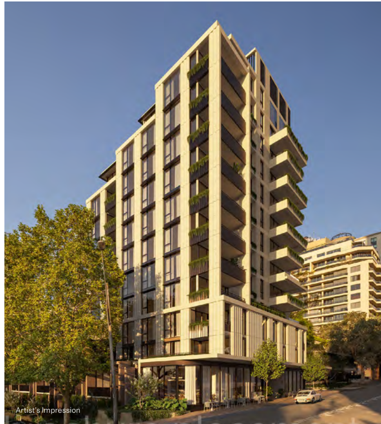
45 McLaren Street, North Sydney, developed by CASA

All pictures, plans and other visual representations are indicative only. Dimensions, floor areas, fittings, specifications, tiling, paving and floor finishes, landscape and paved areas are indicative only and are subject to change. The development is not completed and so the final product may differ from that depicted in this document. Views depicted will not be available from all apartments and may be impacted by future surrounding development. Furnishings are not included. Buyers should refer to and rely on the Contract of Sale. Statements made are true to the best of the Developer's knowledge as of the date of this document. Neither the Developer, nor its officers, employees or agents accepts any liability for any inaccuracy or incompleteness of the information in this document. Interested persons should make and rely on their own investigations and advice and should refer to the Contract of Sale. September 2024