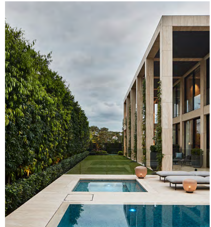
Vista Grove, Toorak, landscaped by Jack Merlo