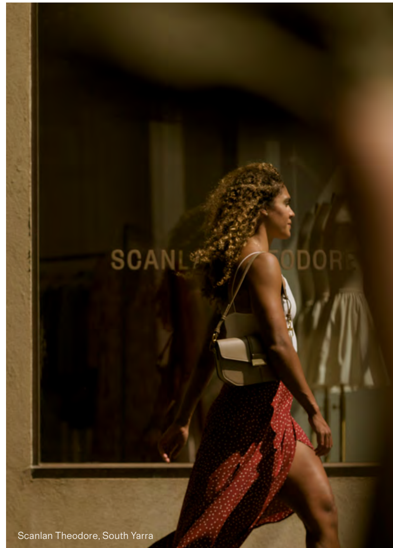
Scanlan Theodore, South Yarra