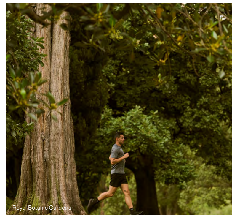
Royal Botanic Gardens

Wander along the Yarra River through local parks to the Royal South Yarra Lawn Tennis Club or to the Royal Botanic Gardens, all within an easy stroll. The Yarra River Reserve and Como Landing are lovely places to relax, where the picnic spots, private rowing sheds and huge playground enjoy spectacular river views.