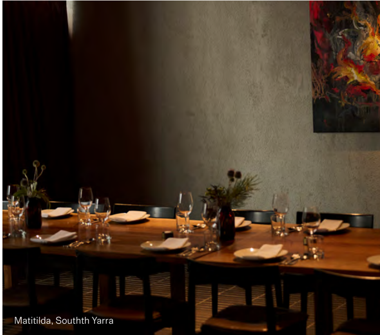
Matilda, Southth Yarra

South Yarra is a vibrant centre of shopping, wining and dining, convenience, entertainment and culture. With a second-to-none hospitality scene, it offers culinary experiences for every taste. Perfect for a night out, Matilda specialises in open fire and hot coals with delicious cocktails and an impressive wine list, while France-Soir is a tiny but truly exceptional celebration of real French food.