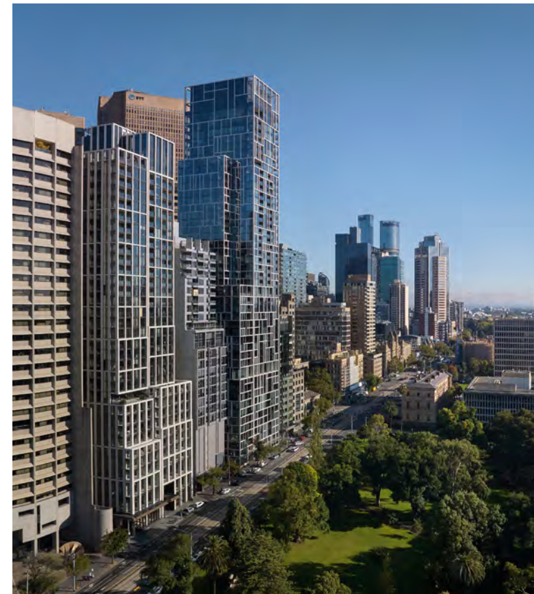
17 Spring Street, Melbourne, designed by Bates Smart

Combining Bates Smart's transformative thinking and timeless design with CASA's commitment to authenticity and sophistication, 671 Chapel Street is an exceptional opportunity. Complemented and emboldened by Jack Merlo's distinctive flora and landscaping, it embodies its place and sets new standards of urban living.