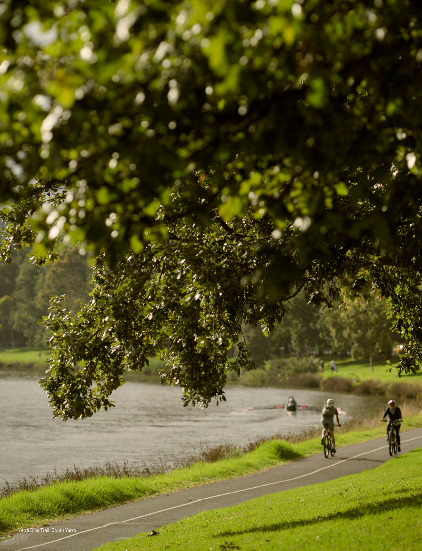
Yarra Bike Trail, South Yarra