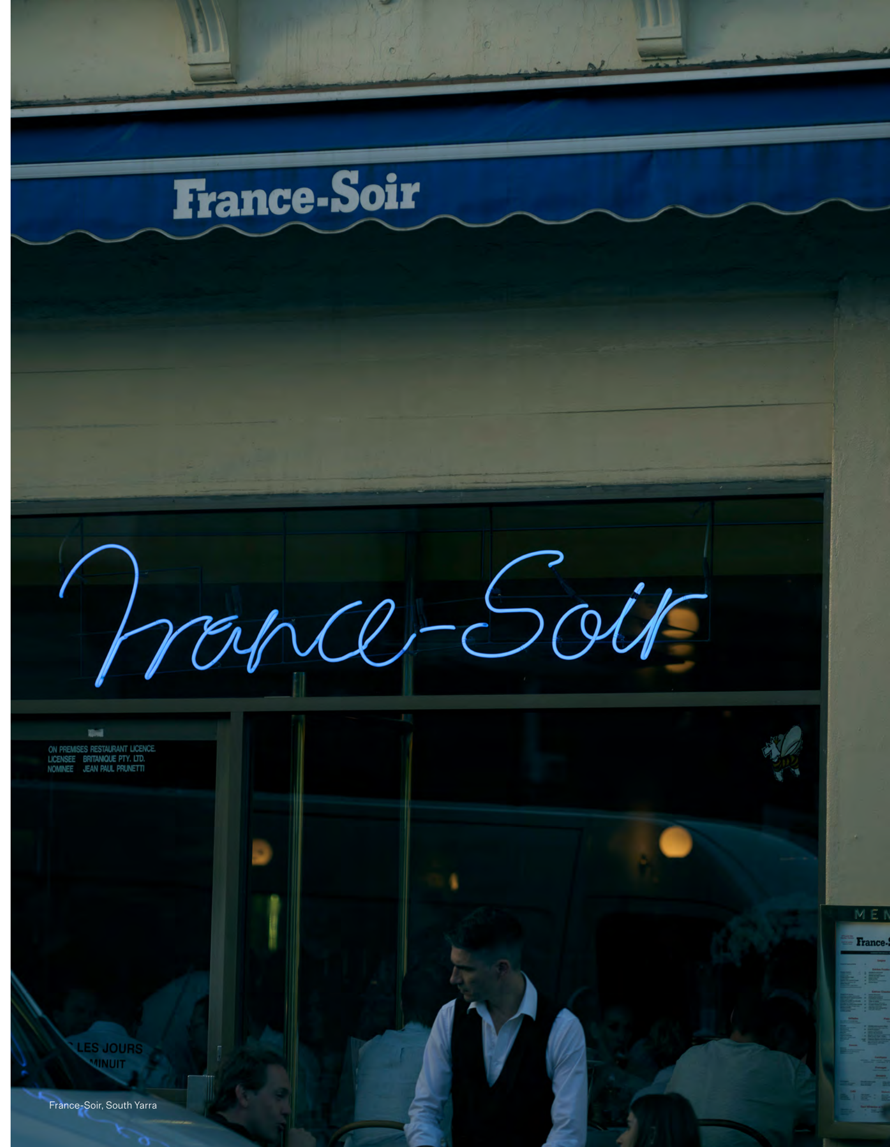
France-Soir, South Yarra

Chapel Street is a kaleidoscope of lifestyle opportunities. For beauty and fashion, Dior and Scanlan & Theodore set the tone, while One Hot Yoga is the place to find mindfulness and movement. Modern art gallery Bromley & Co. is the gateway to the mind of creative visionary David Bromley and one of many notable creative and cultural spaces to visit.