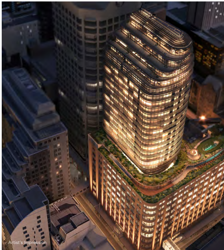
111 Castlereagh, Sydney, sales by Colliers International